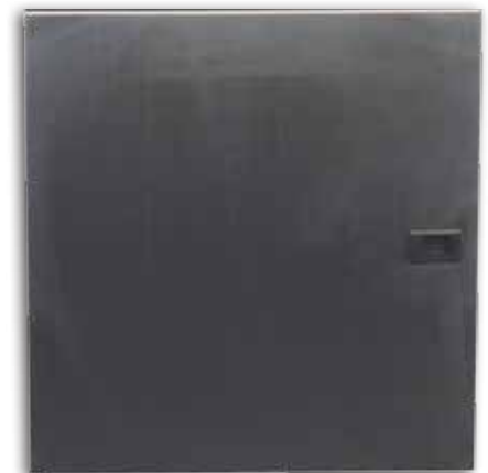
OutBack GSLC 175-AC-120/240 AC-Coupling Center

Holds up to eighteen 0.75"(19mm) wide breakers (1 to 80A), two 1.5"(39 mm) wide breakers (included) and one FLEXnet DC. Support for optional AC Input-Output-Bypass Assembly. AC breakers are rated from 10-60 AAC current. New double pole 50 amp breaker is available to support 120/240V input and loads.