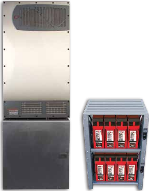
OutBack FLEXcoupled Complete AC-Coupling System