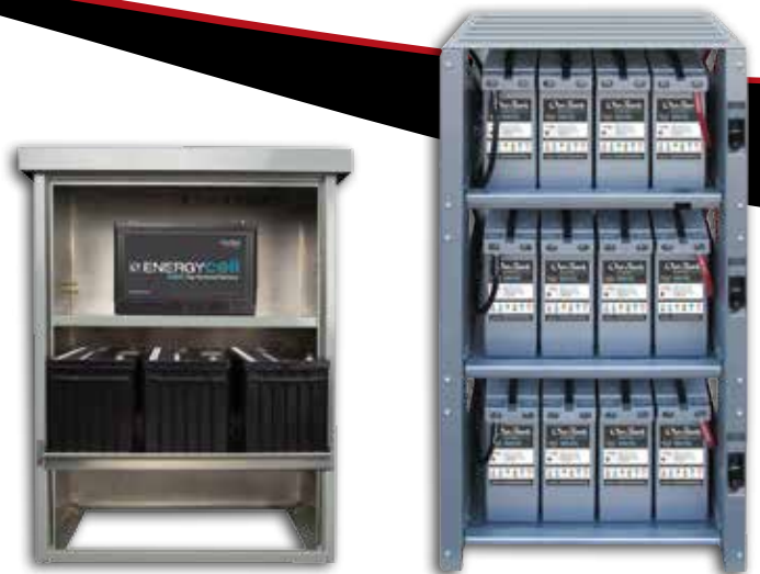
IBE-1 and IBR-3 Enclosures with EnergyCell Nano-Carbon Batteries

The Nano-Carbon is an enhanced and optimized negative active material formulation which makes it more than just a carbon additive. The high surface area carbon is a specially formulated additive for improving the negative active material in lead-acid batteries. Carbon increases conductivity and adds additional capacitance to the battery. Nano-Carbon improves charge efficiency and allows PSoC operation with improved deep discharge recovery.